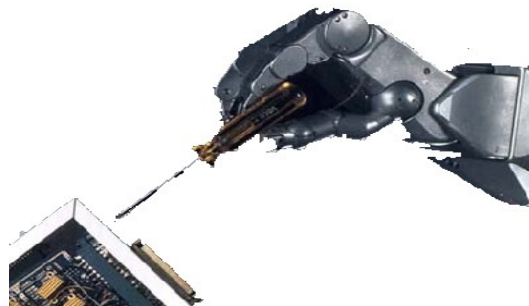
[Robotic Hand at Work] Robotics allow both precision and power to be combined in an integrated system. http://www2.jpl.nasa.gov/technology/images_videos/iv_browse/Robotics_browse.jpg